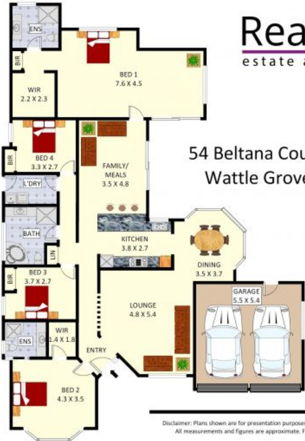
54 Beltana Court, Wattle Grove