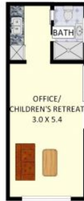
Office/ Children's Retreat