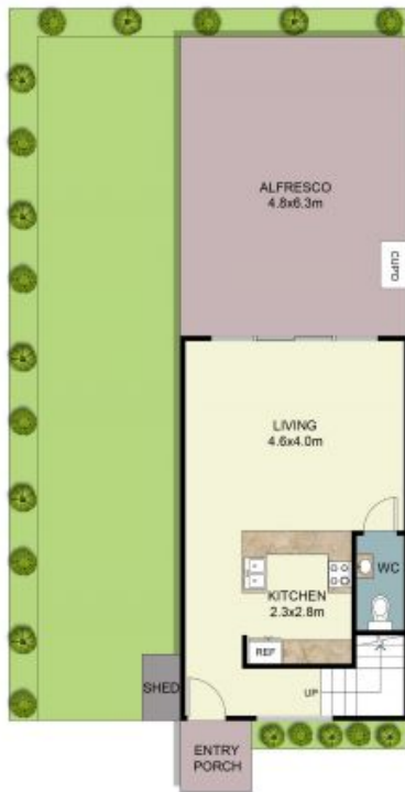
GROUND FLOOR PLAN ON SITE PLAN