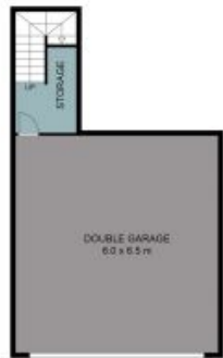
BASEMENT FLOOR PLAN