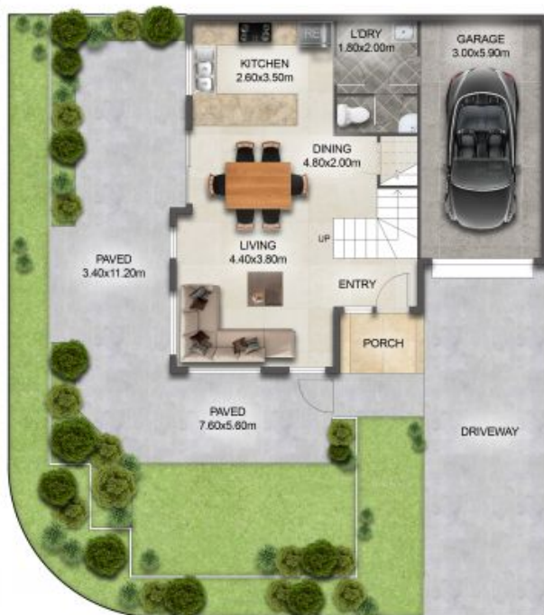
GROUND FLOOR PLAN ON SITE PLAN

While every attempt has been made to ensure the accuracy of the floor plan contained herein, measurements of areas, volumes, sizes and any other facts are approximate and no responsibility is taken for any error, omission, or misstatement. This plan is for illustrative purposes only and should be used as such by any prospective purchaser.