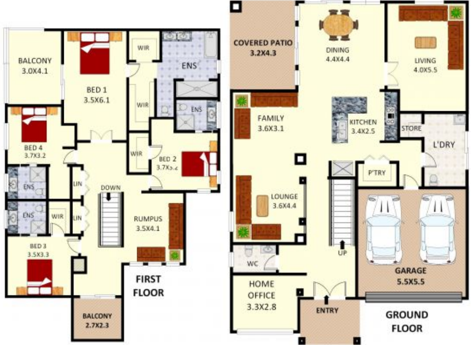
16 Fairway Close, Moorebank

Plans shown are only indicative of layout. Dimensions are approximate.