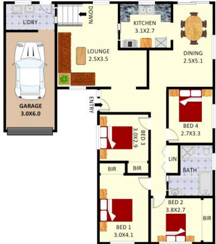
67B Ascot Drive, Chipping Norton

Plans shown are only indicative of layout. Dimensions are approximate.