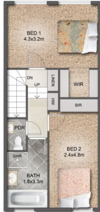
LEVEL 2 PLAN