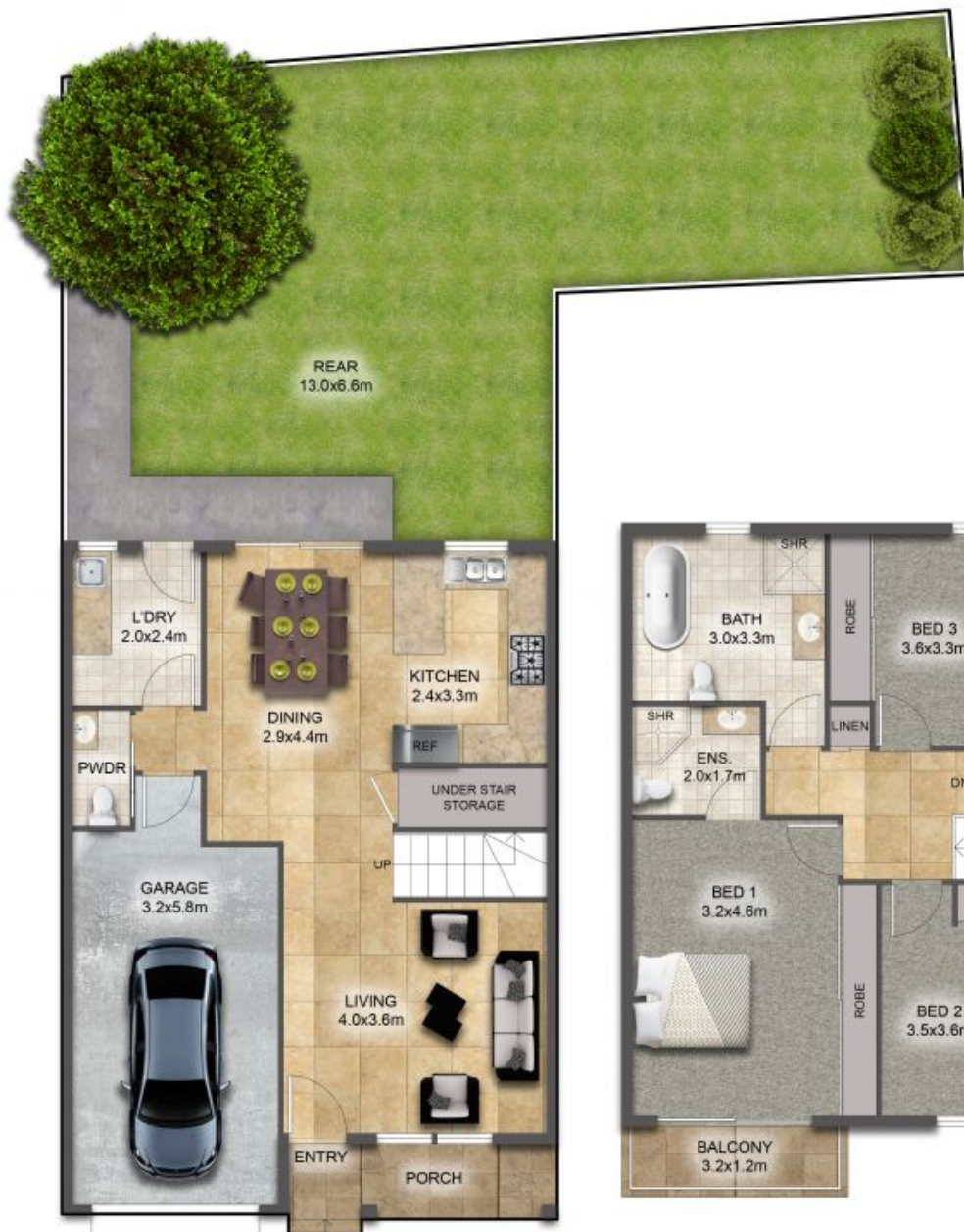
GROUND FLOOR PLAN ON SITE PLAN