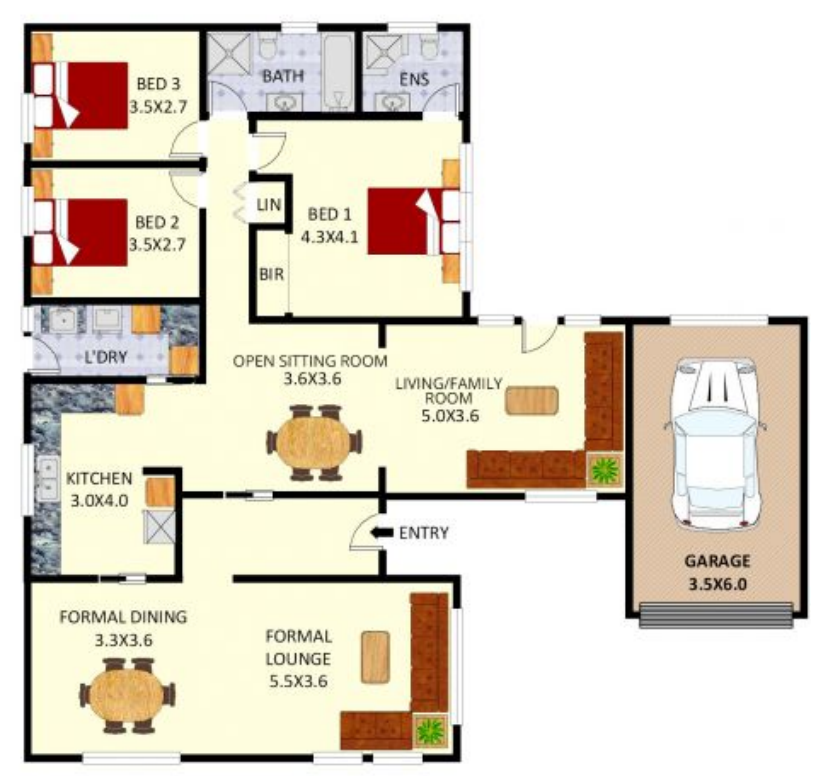
22 IKara Crescent, Moorebank

Disclaimer: Plans shown are for presentation purposes and are not part of any legal document. All measurements and figures are approximate. JORDAN FLOOR PLANS: 0426400687