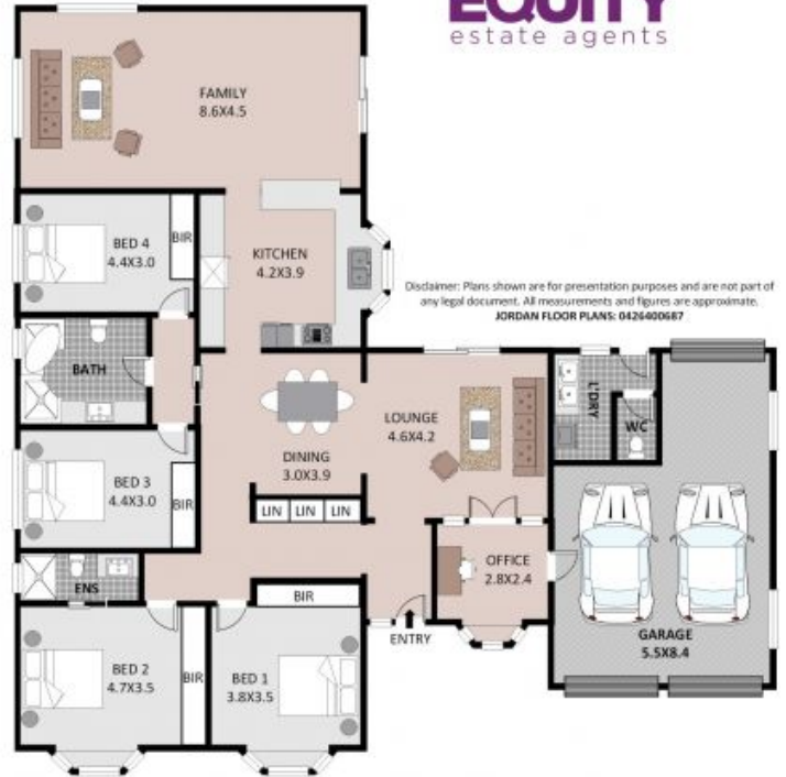
7 Derby Crescent, Chipping Norton

Plans shown are only indicative of layout. Dimensions are approximate.